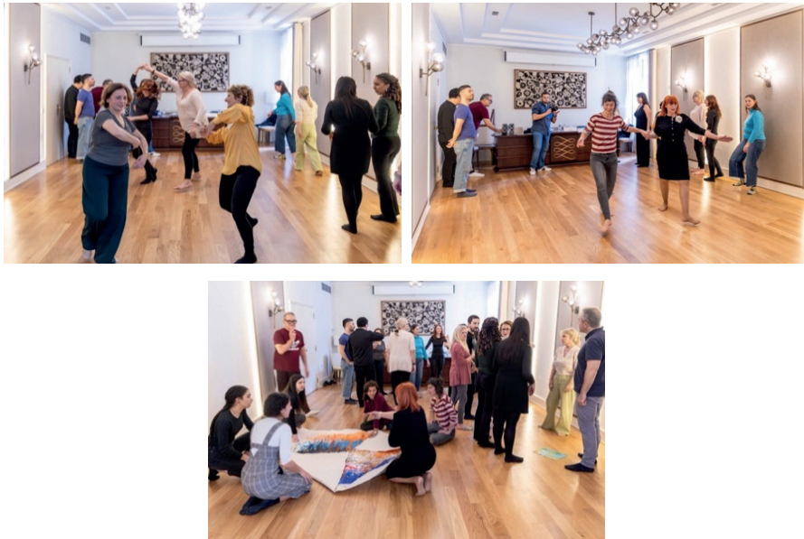
Figure 6. Exploring mental time travel: space, time, our identity through movement, and how we do so both individually and as a team, when divided into groups, given 'tasks' to respond to.