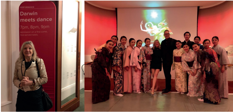
Figure 2. Darwin meets Dance performed at the Royal Society in December 2018.

Working together over such an extended period has allowed us to explore our ways of working and how we can integrate them together using the commonalities in our backgrounds as well as the obvious differences in our skill sets and experiences in many ways. Some of key ideas are illustrated in our book Movement in Mind , which has yet to be published but is shown below.