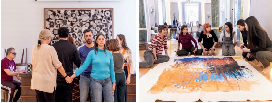
Figure 5. Wordless story telling through dance at the BIAL Foundation event.