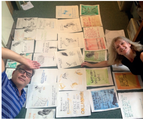
Figure 3. Pages from Movement in Mind .

Working together over such an extended period has allowed us to explore our ways of working and how we can integrate them together using the commonalities in our backgrounds as well as the obvious differences in our skill sets and experiences in many ways. Some of key ideas are illustrated in our book Movement in Mind , which has yet to be published but is shown below.