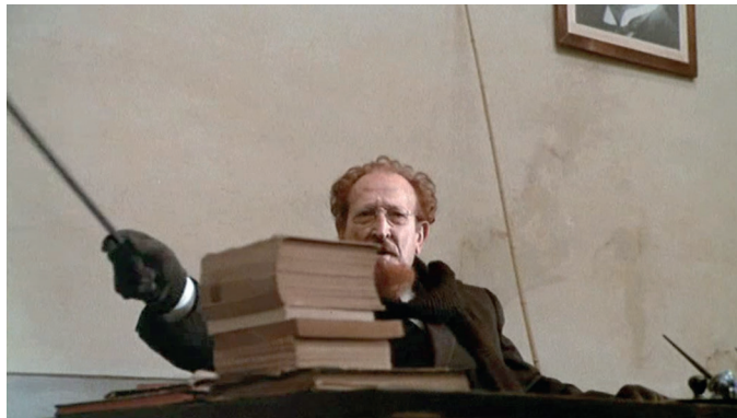
Figure 1. Frame from Amarcord (00:17:09) by Federico Fellini, 1973. Camera by Giuseppe Rotunno; produced by Franco Cristaldi; distributed by Warner Bros.

Cinema, a unique and creative art form, offers an immersive reality experience unlike any other. In this short review, we discuss into how movies challenge commonly held notions of image representation by the brain. Vision, often simplified into basic stimulus-response processes, is enriched by the context of embodied experiences. We propose that the cinematic experience provides a singular and valuable framework for investigating crucial issues in contemporary vision sciences, such as perceptual binding and attention. Furthermore, we explore how studying perception through film phenomenology can be an effective way to teach the biological foundations of vision.