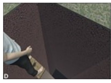
S1 | physiological responses during a life-threatening event