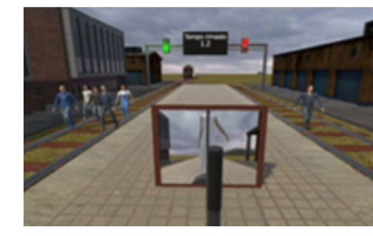
S4 | solving the Trolley and the Footbridge dilemmas