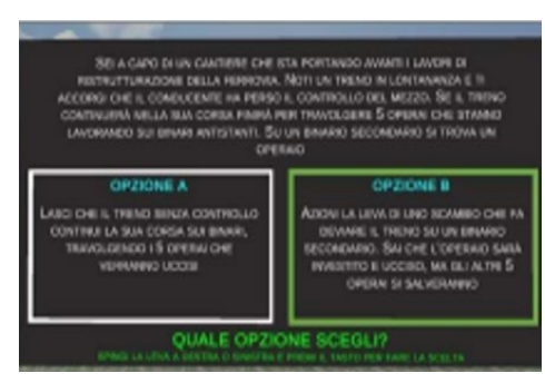
S3 | solving 30 text-based moral dilemmas